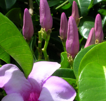
Ornamental rubber vine flowers are 4 - 6cm long and about 2.5cm wide. They are trumpet-shaped with 5 petals, pink to purple inside and outside.