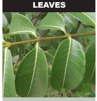
Shiny dark green leaves in opposite pairs, 6 - 10cm long and 3 - 5cm wide. Leaf stalk is not purple, which distinguishes it from the similar 'true' rubber vine (C.grandiflora).