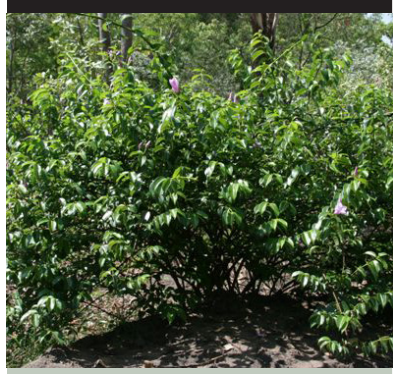
Woody, many-stemmed vine climbing 30m into tree canopies, or 1 - 3m as a shrub if unsupported.