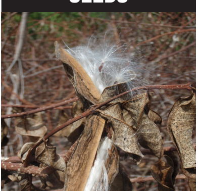
The seeds have a tuft of long white silky hair at one end and are easily spread by wind, water and birds.

Weed Management Officers from the Weed Management Branch can provide advice on all aspects of weed management including control techniques, biological control, legislative responsibilities, policy advice, monitoring and regional planning. For further information on weed management planning, integrated control, herbicide application techniques and monitoring please refer to the <u>NT Weed Management Handbook</u>.