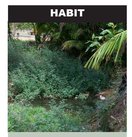
A semi aquatic floating perennial herb. Can grow on land in damp soil or in water as thick floating mats.

Water mimosa is not currently a declared weed in the Northern Territory.