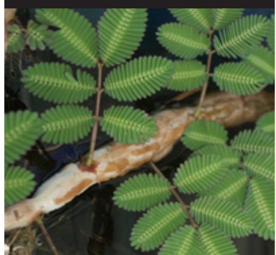
Stems grow out over the water and form a thick spongy, fibrous covering that aids floatation.