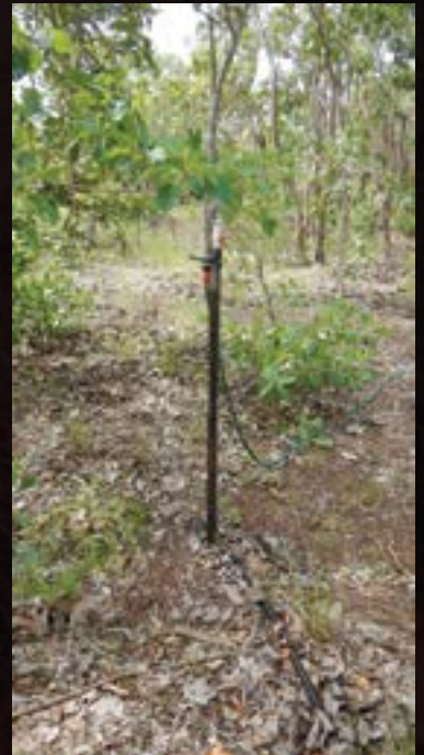
Sprinklers can be used to wet down vegetation in the event of wildfire