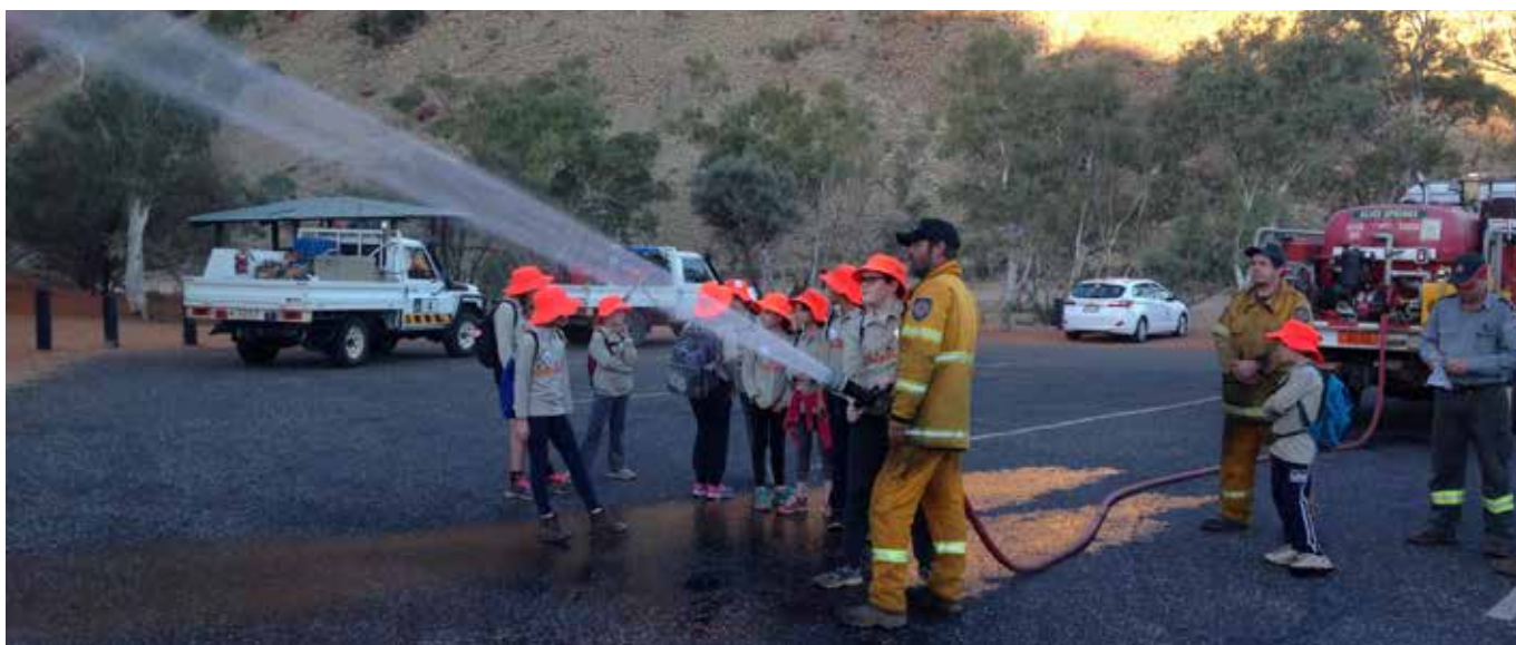
Junior Rangers getting the chance to try out some of the fire fighting equipment used by Volunteers