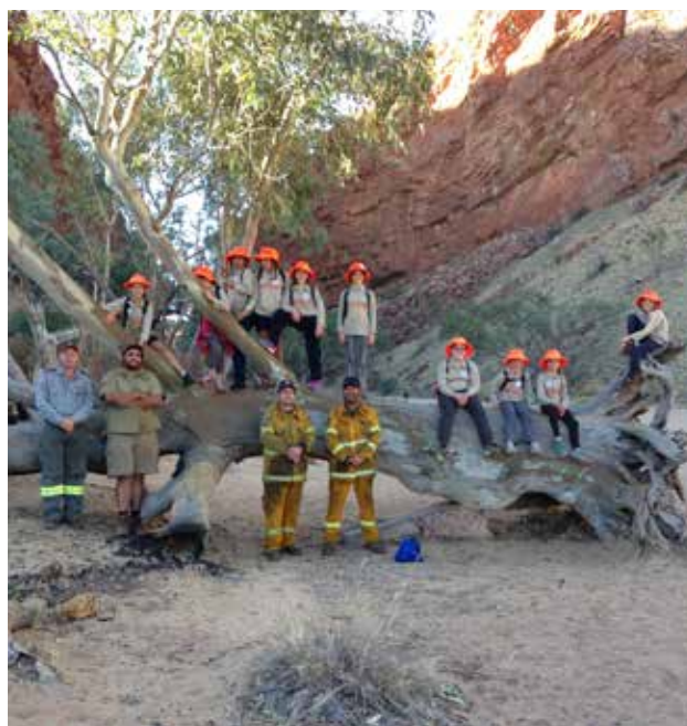
Junior Rangers joined Volunteer Bushfire Brigade members at Simpson's Gap for the Fascinating Fire sessions

The young rangers also had the chance to use some of the fire-fighting equipment and learn about the importance of using the correct Personal Protective Equipment.