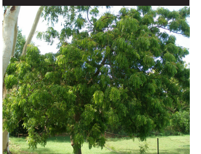
A fast growing tree 12 - 24m high.