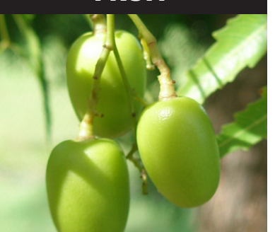
Ripe fruit are yellow in colour and similar to olives in size and shape.

Weed Management Officers from the Weed Management Branch can provide advice on all aspects of weed management including control techniques, biological control, legislative responsibilities, policy advice, monitoring and regional planning. For further information on weed management planning, integrated control, herbicide application techniques and monitoring please refer to the <u>NT Weed Management Handbook</u>.