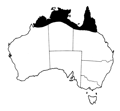
Figure 2: The distribution of the freshwater crocodile Crocodylus johnstoni in Australia (Source: Cogger 2000).

Geographic variation in morphology has been shown, however the extent of geographic variation across its entire range is yet to be determined (Webb and Manolis 1993, Edwards et al. in prep. ). Some populations of freshwater crocodile are strikingly stunted with mature males reaching only 1.2 metres in total length and weighing 7 kilograms (Webb and Manolis 1989).